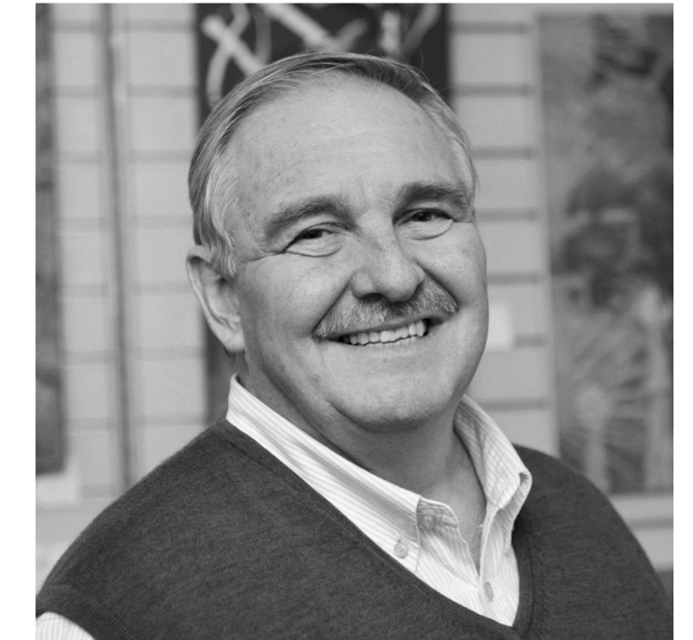
Professor David Nutt Advisor